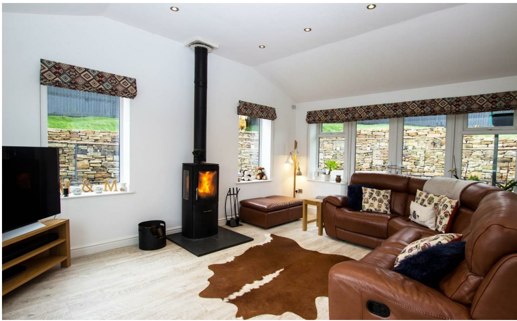
Porch 3'8" x 3'11"