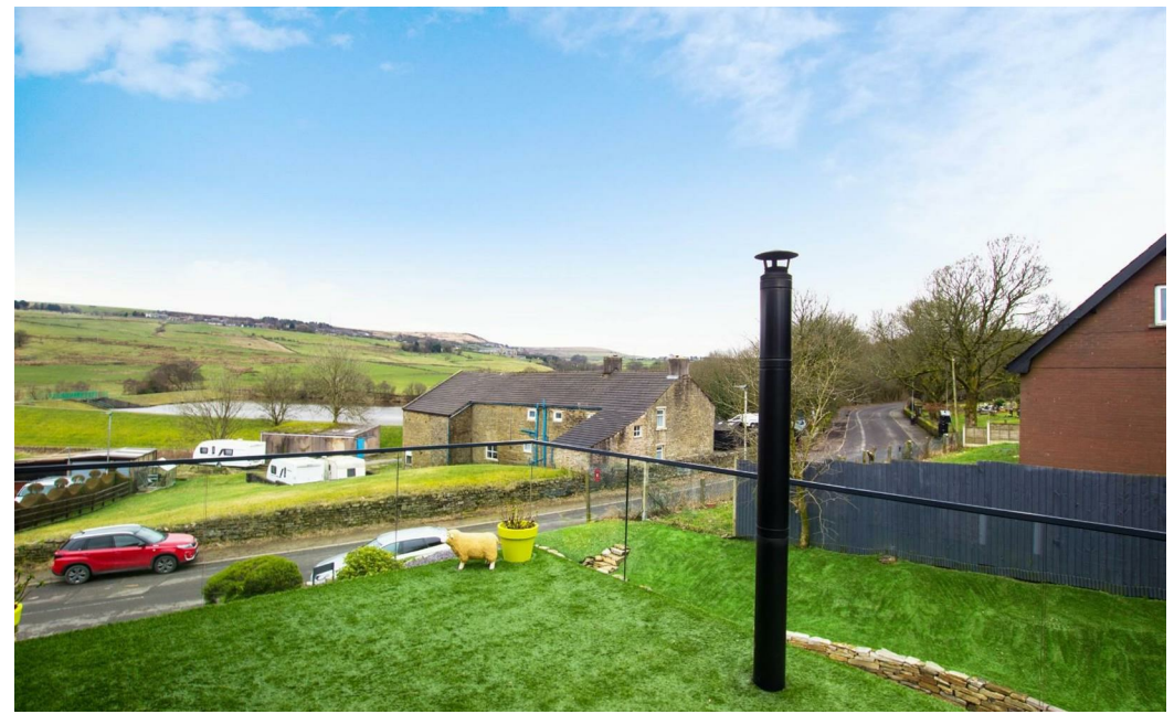
Bedroom Three 12'7" x 9'1"