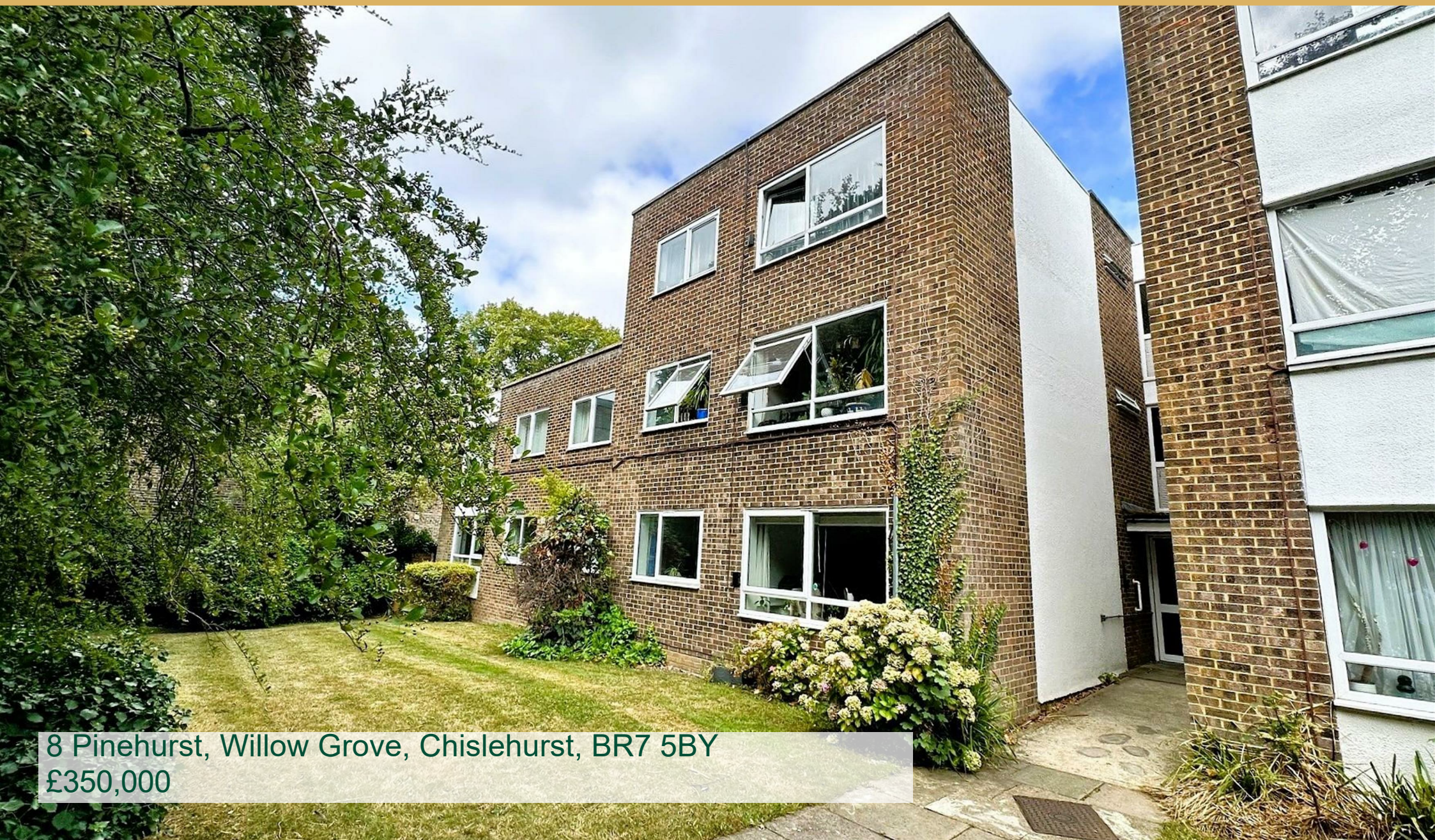
8 Pinehurst, Willow Grove, Chislehurst, BR7 5BY £350,000