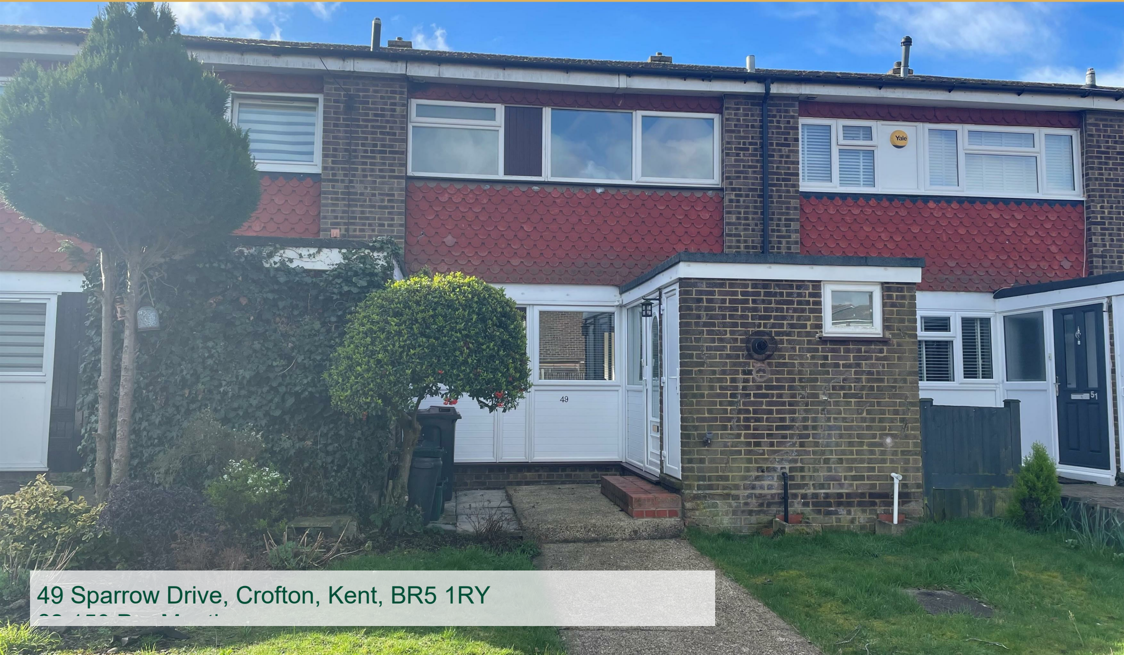
49 Sparrow Drive, Crofton, Kent, BR5 1RY