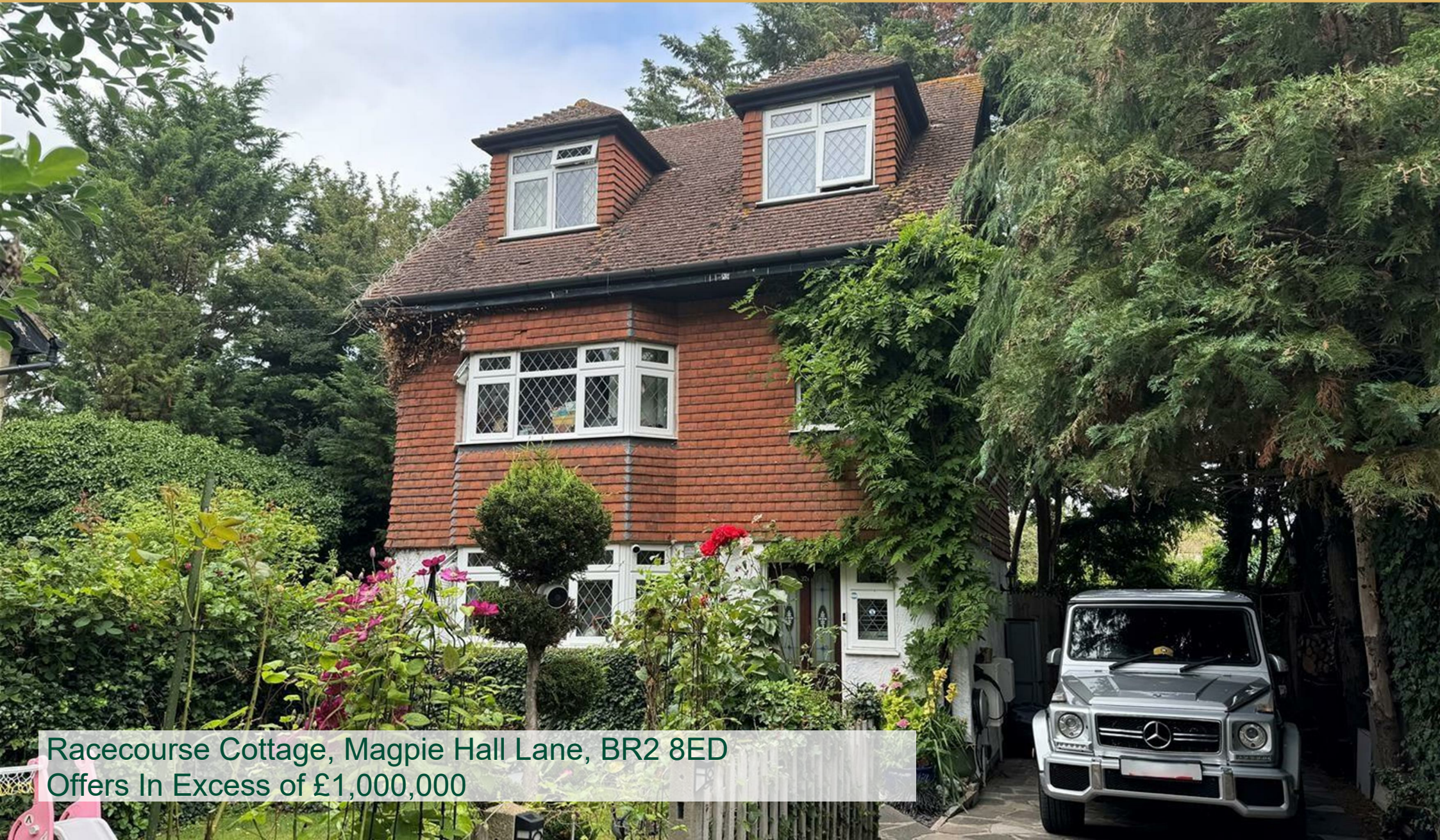
Racecourse Cottage, Magpie Hall Lane, BR2 8ED Offers In Excess of £1,000,000