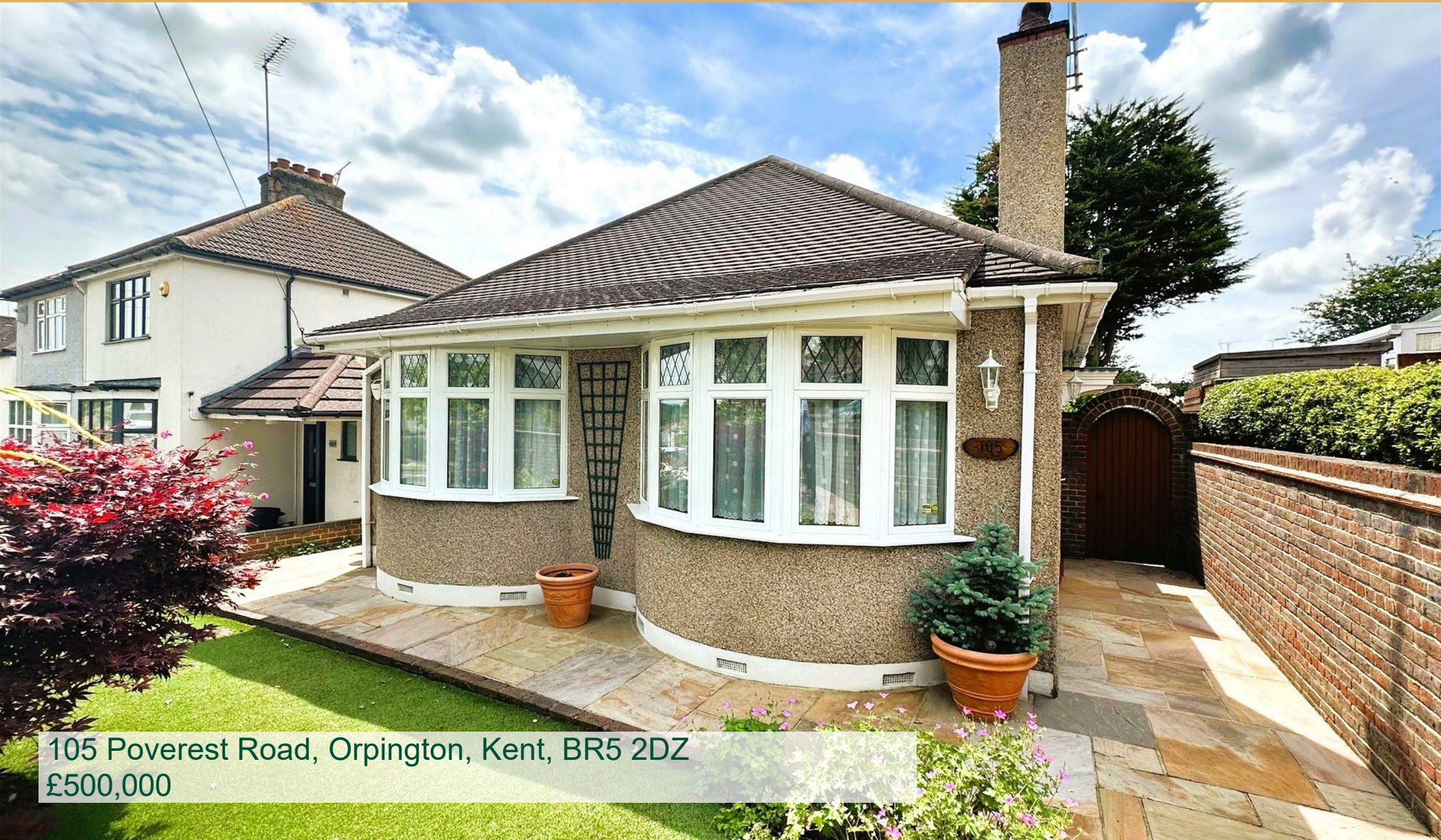
105 Poverest Road, Orpington, Kent, BR5 2DZ £500,000