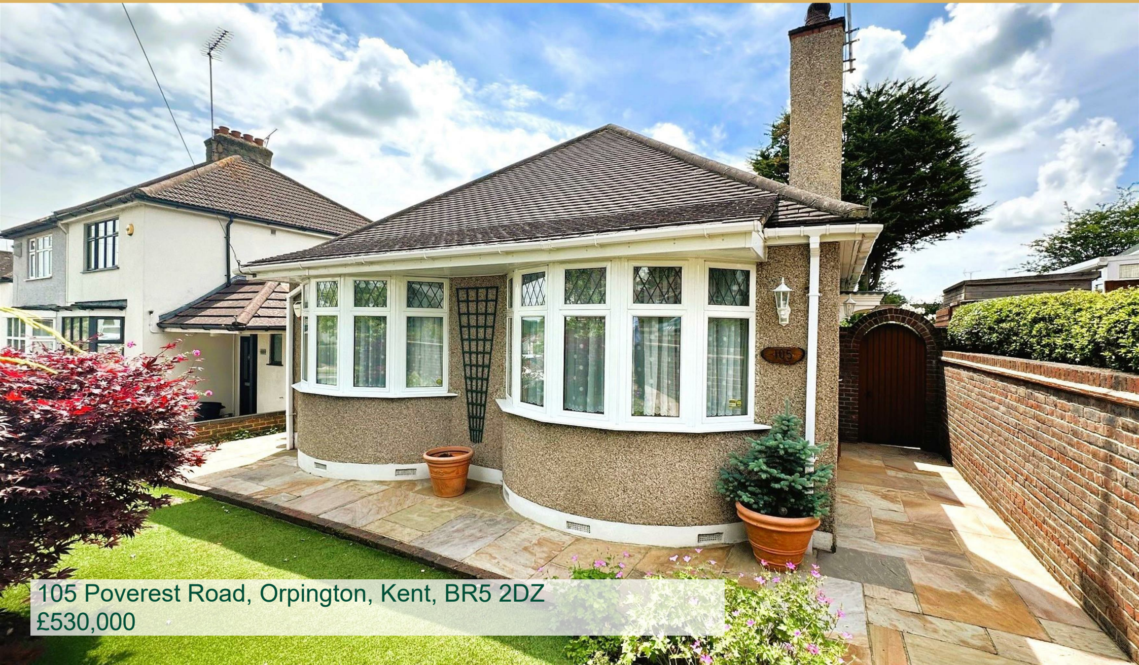
105 Poverest Road, Orpington, Kent, BR5 2DZ £530,000