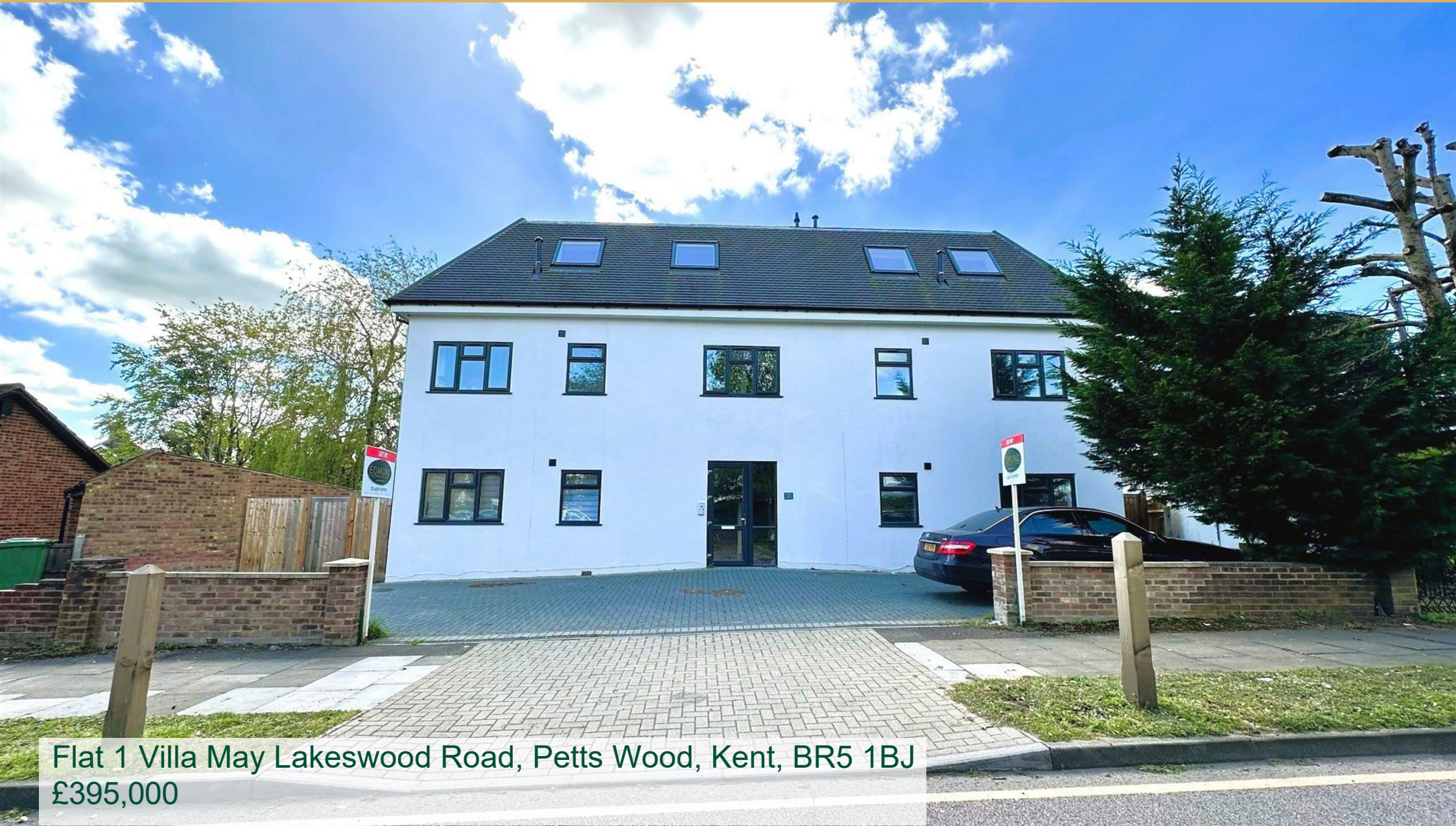
Flat 1 Villa May Lakeswood Road, Petts Wood, Kent, BR5 1BJ £395,000