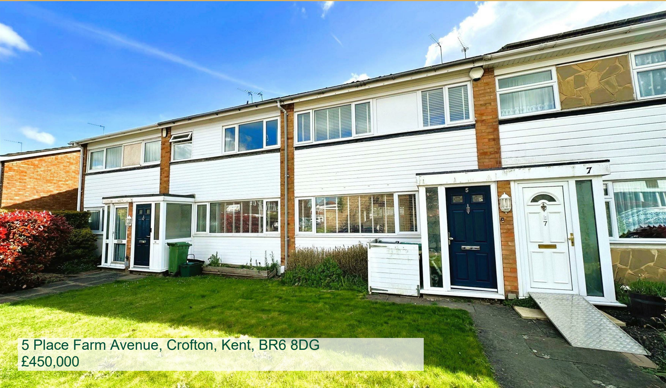
5 Place Farm Avenue, Crofton, Kent, BR6 8DG £450,000