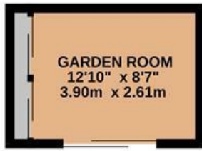
GROUND FLOOR 492 sq.ft. (45.7 sq.m.) approx.