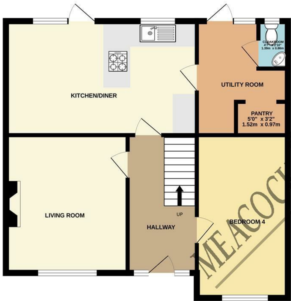
GROUND FLOOR 670 sq.ft. (62.3 sq.m.) approx.