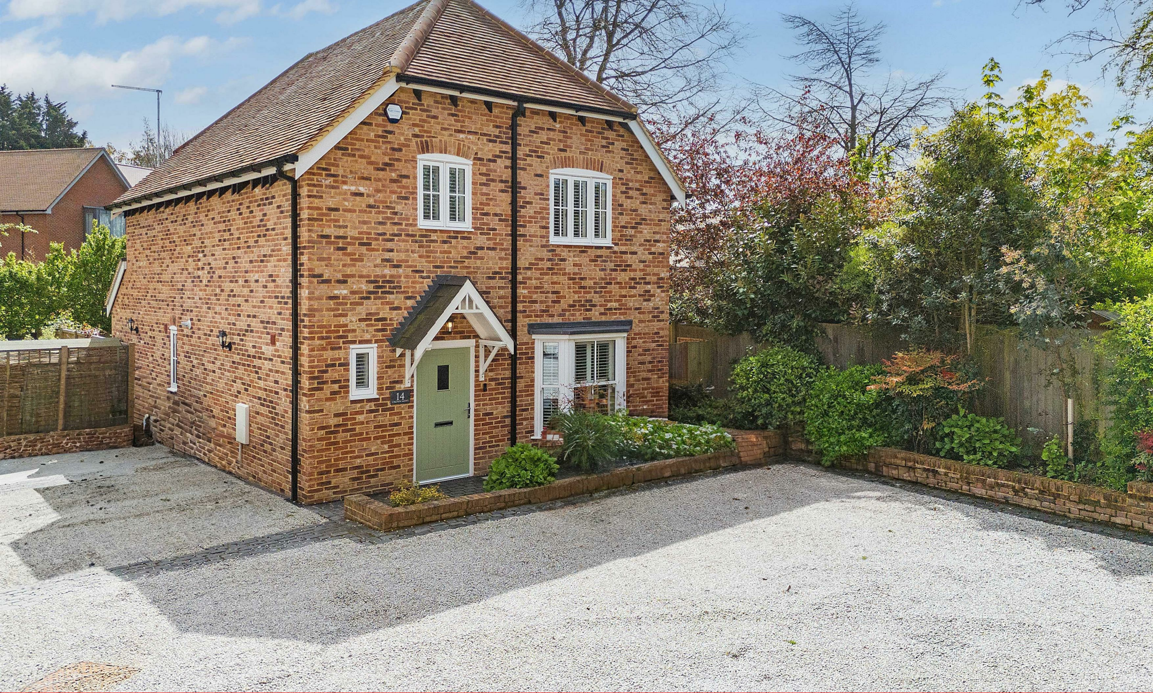
14 Crown Mews £965,000 MEACOCK & JONES