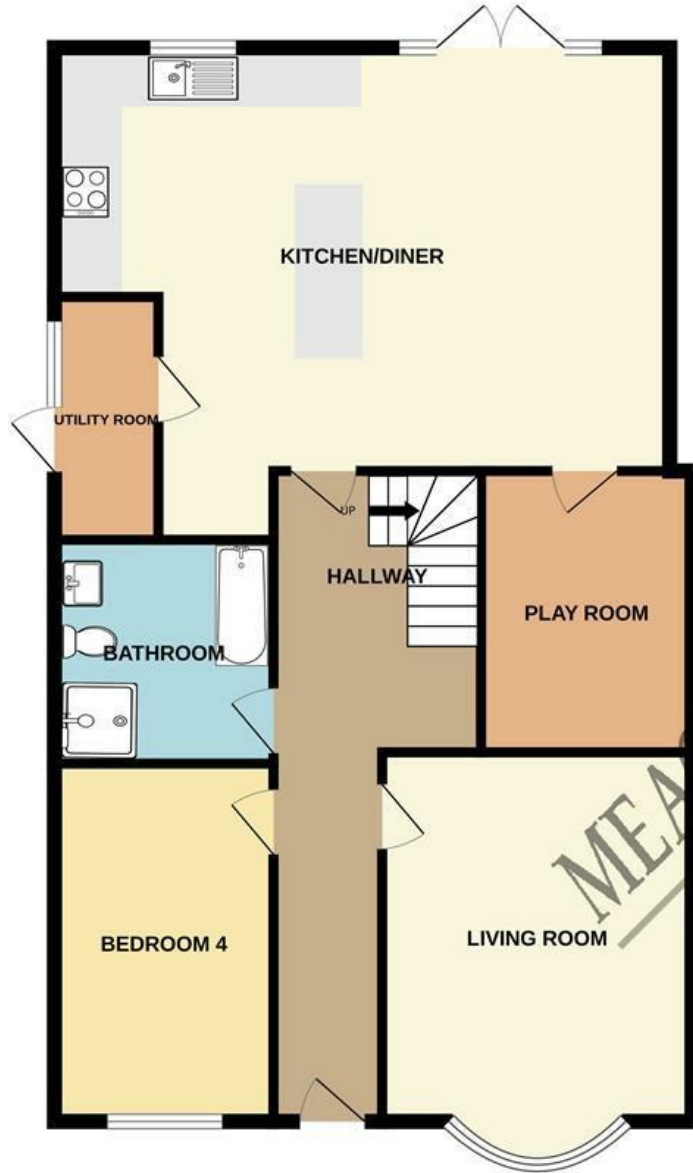
GROUND FLOOR 1008 sq.ft. (93.6 sq.m.) approx.