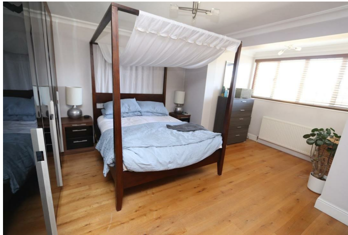
Bedroom One 14'7 max x 13'7 max (4.45m max x 4.14m max)