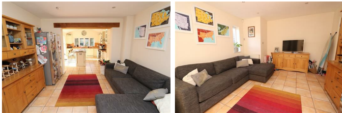
Kitchen/Breakfast Room 29'6 max x 11'8 max (8.99m max x 3.56m max)