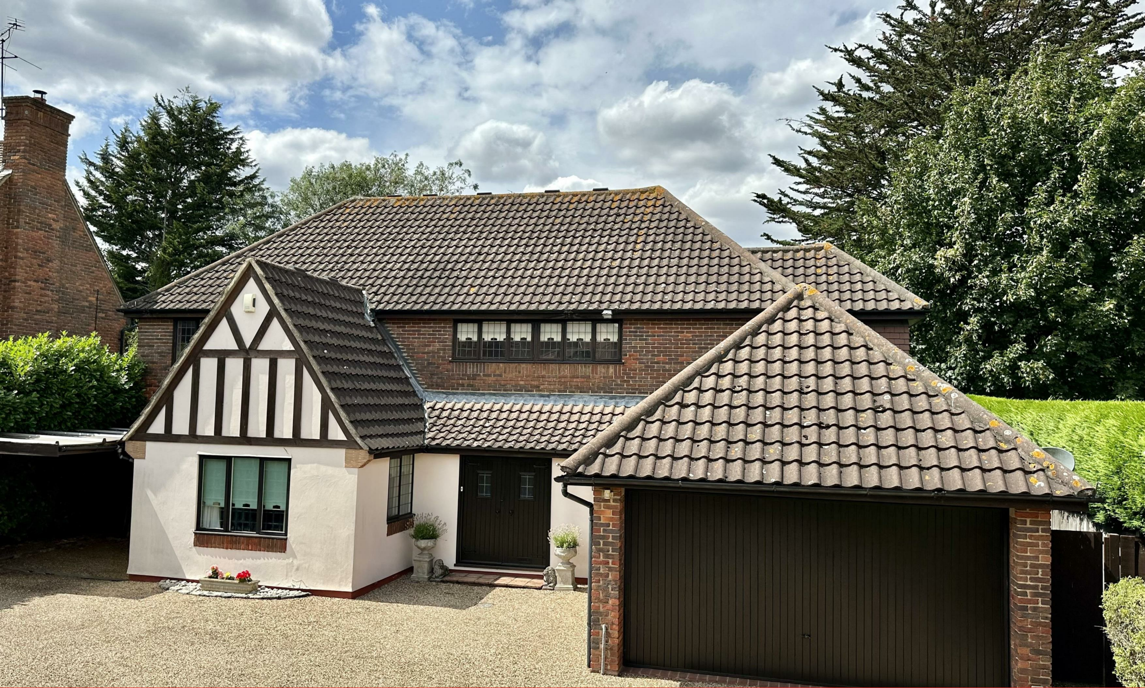
Hampshire House Hutton Gate Hutton Mount