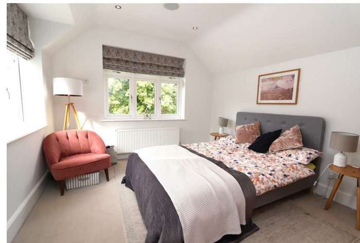
Bedroom Three 14'2 x 10'8 (4.32m x 3.25m)

Another dual aspect bedroom with windows to front and side elevations. Two radiators. Spotlights to ceiling. A range of built-in wardrobes with cupboards above provide excellent hanging and shelving space. Doors to:-