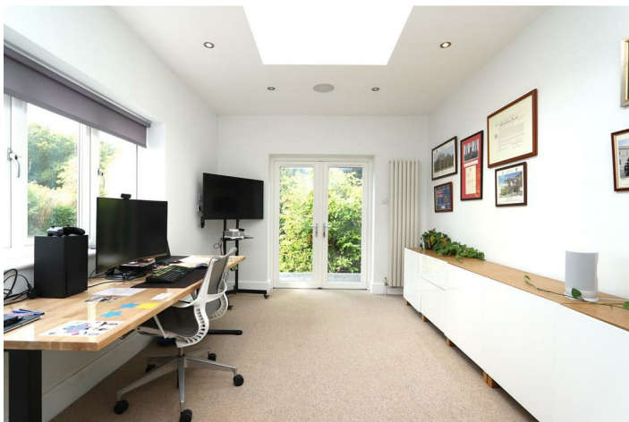
Second Study/Gymnasium 15'3 x 10'7 (4.65m x 3.23m)

A lovely bright room drawing light from french doors that lead to the rear garden terrace with windows to side and a large glazed atrium with electronically operated opening windows to the ceiling. This room is currently being used as a study, though could otherwise serve as an excellent gymnasium, games room or additional sitting room. Spotlights and integrated audio speakers to the ceiling. Two radiators.