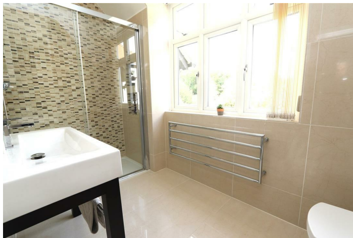
En-Suite Shower Room 11' x 5'9 (3.35m x 1.75m)

A luxuriously appointed room with a wide tiled shower enclosure, feature wash hand basin with mixer tap and back to wall WC with concealed cistern. Tiling to floor and to full ceiling height. Spotlights to ceiling. Window to rear elevation. Towel rail and heated and contemporary style radiator.