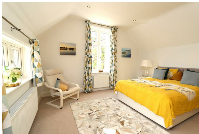
Bedroom Two 13'8 x 13'3 (4.17m x 4.04m)

Bedroom two is also situated at the rear of the property with windows to rear and side elevations. Radiator. Spotlights to ceiling. Integrated speakers. Frosted glazed door to:-