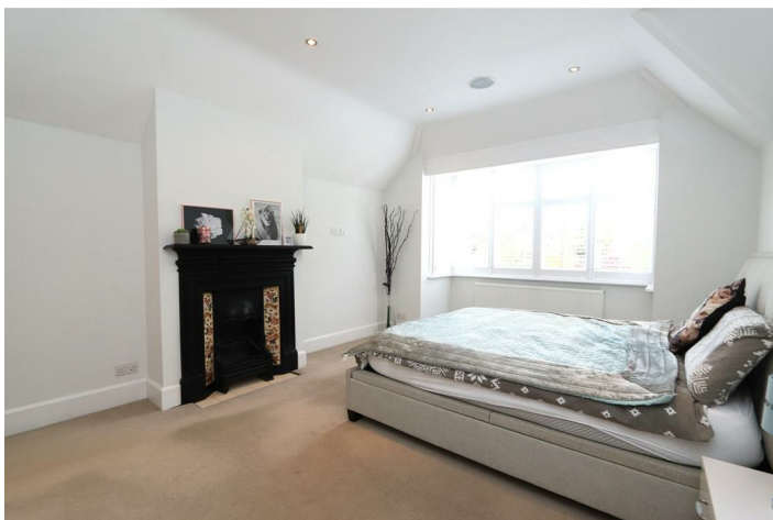
Master Bedroom 17'3 x 12'1 (5.26m x 3.68m)

A window to the rear elevation provides attractive views of the expansive and magnificent plot. Spotlights to ceiling. Integrated ceiling speakers. Radiator. Feature Victorian style fireplace with attractive tiled inserts. The bedroom leads to the:-