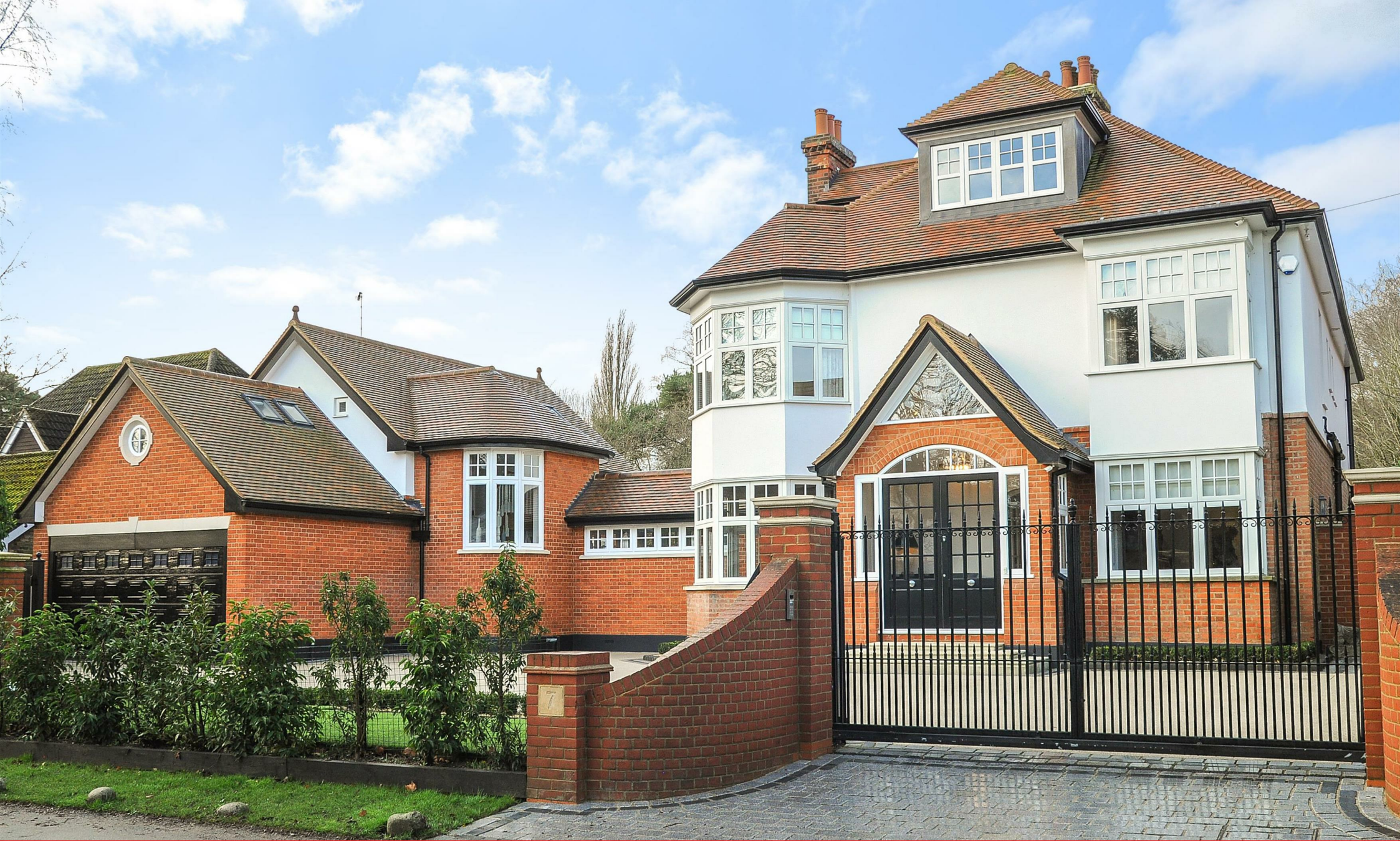
Hillwood House Hillwood Grove Hutton Mount