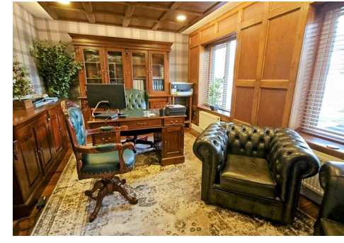
Calve Croft Road Approximate Gross Internal Area 3282 sq ft - 305 sq m