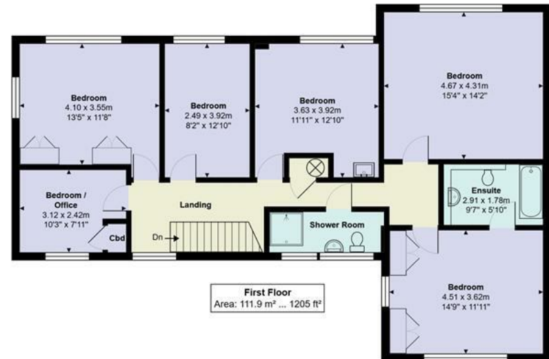
First Floor Area: 111.9 m 2 ... 1205 ft 2