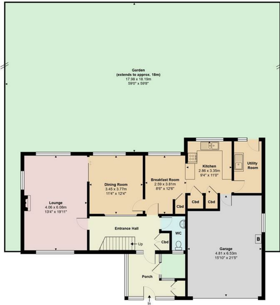
Ground Floor Area: 124.3 m 2 ... 1338 ft 2