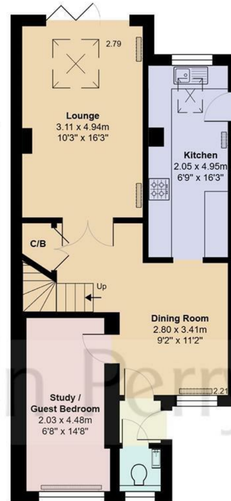
Ground Floor Area: 56.8 m 2 ... 612 ft 2