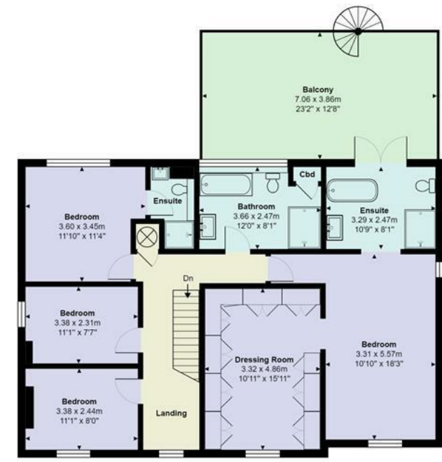
First Floor Area: 103.9 m 2 ... 1119 ft 2