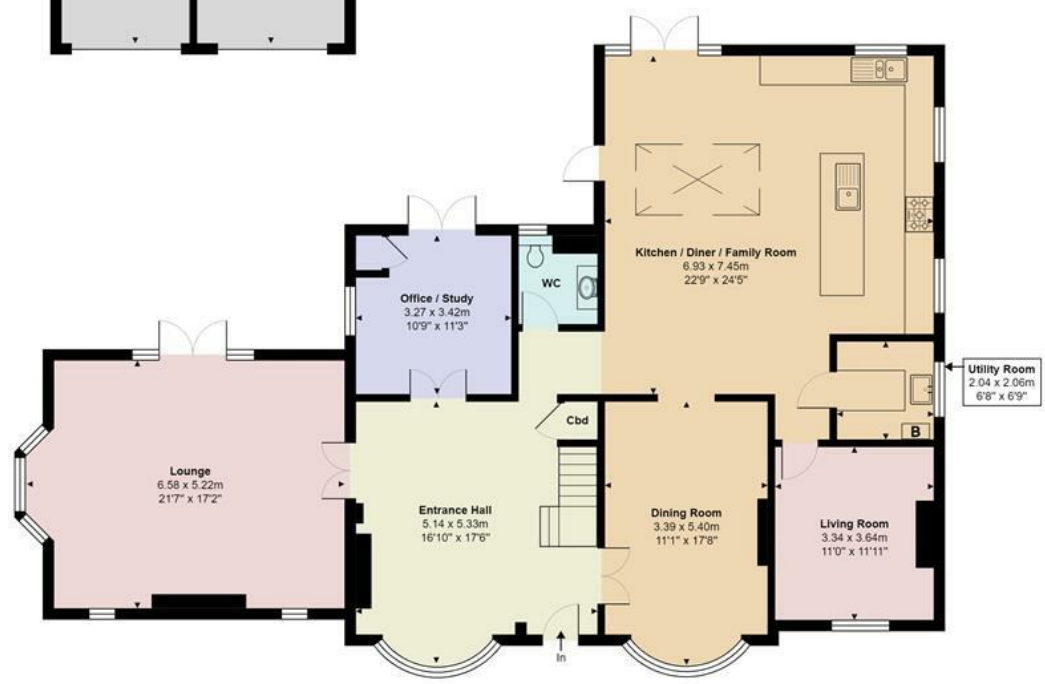
Ground Floor Area: 163.9 m 2 ... 1765 ft 2