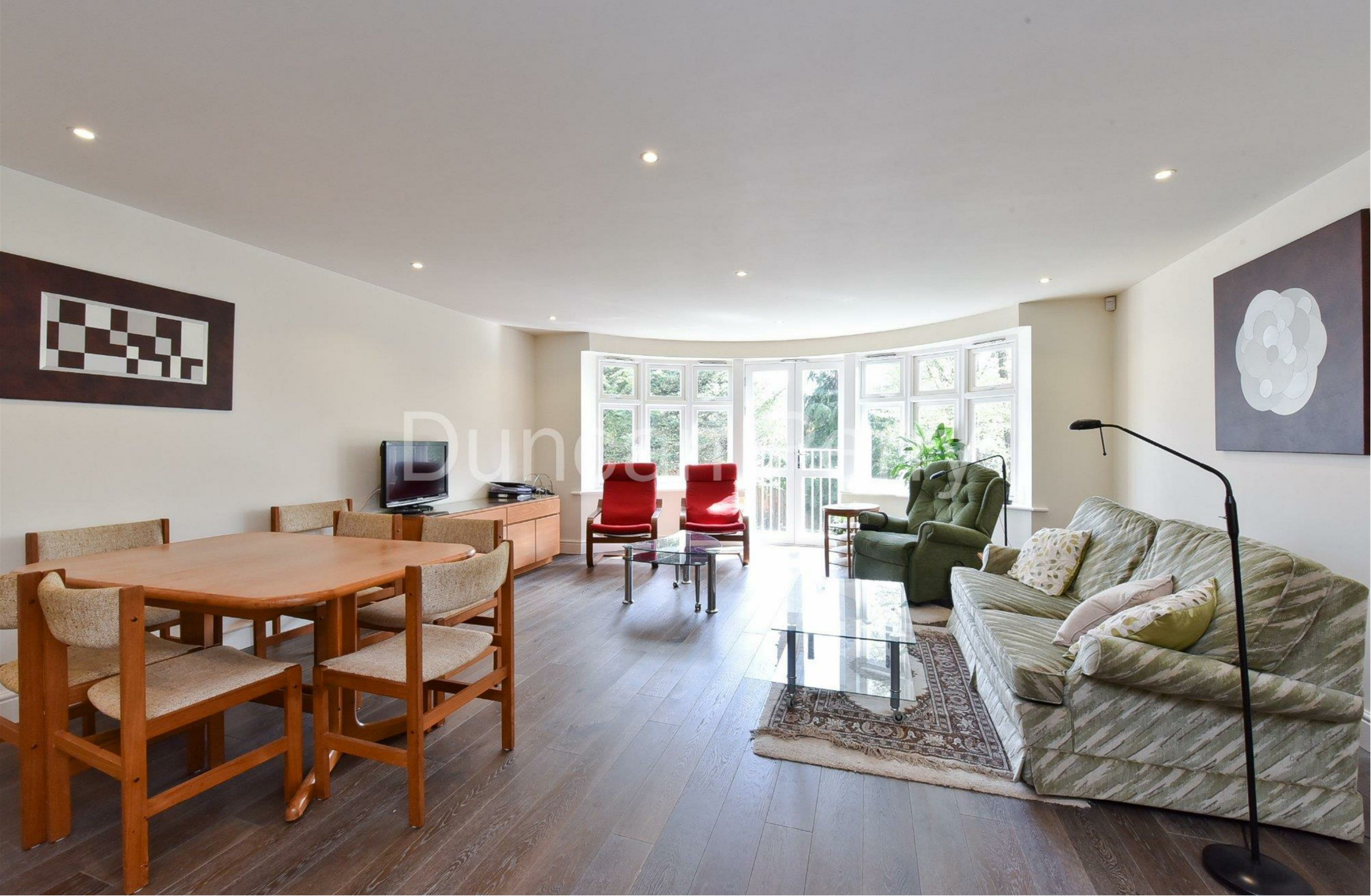
Bradmore House Bradmore Way, Brookmans Park, AL9 7QX