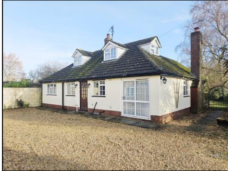
The White Cottage