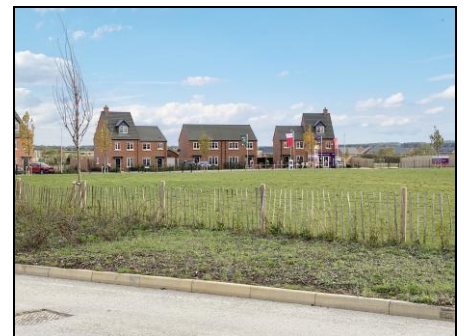
View To Front