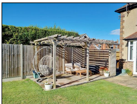
Further Garden Aspect