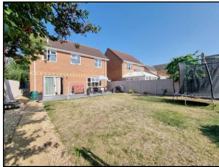
Further Garden Aspect