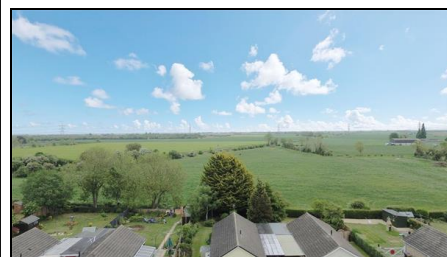
View To Rear

Agent's Note: These particulars are set out for the guidance of proposed purchasers and act as a general guideline and do not constitute part of an offer or contract. Measurements shown are approximate and are to be used as a guide only and should not be relied upon when ordering carpets etc. We have not tested the equipment or central heating system if mentioned in these particulars and prospective purchasers are to satisfy themselves as to their order. All descriptions, references to condition or permissions are given in good faith and are believed to be correct, however, any prospective purchasers should not rely on them as statements or representations of fact and purchasers should satisfy themselves by inspection or otherwise as to the authority to give any warranty or representation whatsoever in respect of this property. No responsibility can be accepted for any expenses incurred by intending purchasers in inspecting properties that have been sold or withdrawn.