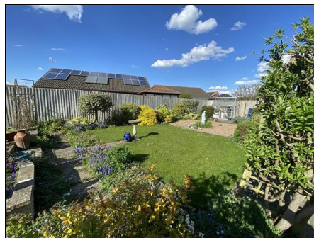
Further Garden Aspect