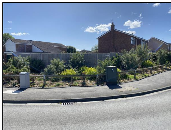
Front Aspect From Road