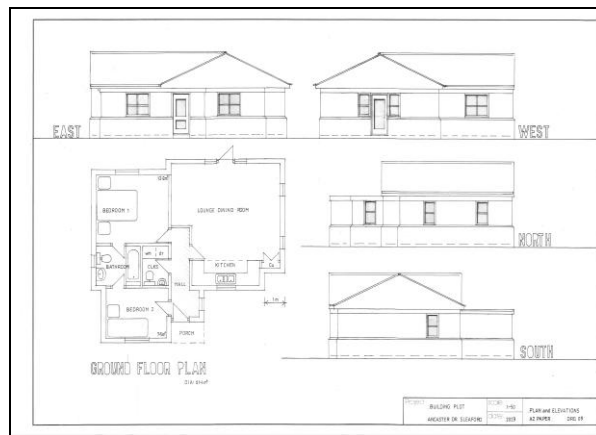
Plan & Elevations