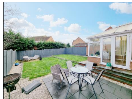
Further Garden Aspect

Agent's Note: These particulars are set out for the guidance of proposed purchasers and act as a general guideline and do not constitute part of an offer or contract. Measurements shown are approximate and are to be used as a guide only and should not be relied upon when ordering carpets etc. We have not tested the equipment or central heating system if mentioned in these particulars and prospective purchasers are to satisfy themselves as to their order. All descriptions, references to condition or permissions are given in good faith and are believed to be correct, however, any prospective purchasers should not rely on them as statements or representations of fact and purchasers should satisfy themselves by inspection or otherwise as to the authority to give any warranty or representation whatsoever in respect of this property. No responsibility can be accepted for any expenses incurred by intending purchasers in inspecting properties that have been sold or withdrawn.