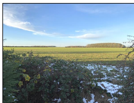
View To Rear

Agent's Note: These particulars are set out for the guidance of proposed purchasers and act as a general guideline and do not constitute part of an offer or contract. Measurements shown are approximate and are to be used as a guide only and should not be relied upon when ordering carpets etc. We have not tested the equipment or central heating system if mentioned in these particulars and prospective purchasers are to satisfy themselves as to their order. All descriptions, references to condition or permissions are given in good faith and are believed to be correct, however, any prospective purchasers should not rely on them as statements or representations of fact and purchasers should satisfy themselves by inspection or otherwise as to the authority to give any warranty or representation whatsoever in respect of this property. No responsibility can be accepted for any expenses incurred by intending purchasers in inspecting properties that have been sold or withdrawn.