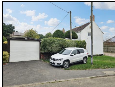
Garage & Parking