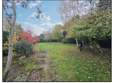
Further Rear Garden Photos