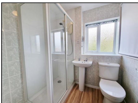
1st Floor Shower Room