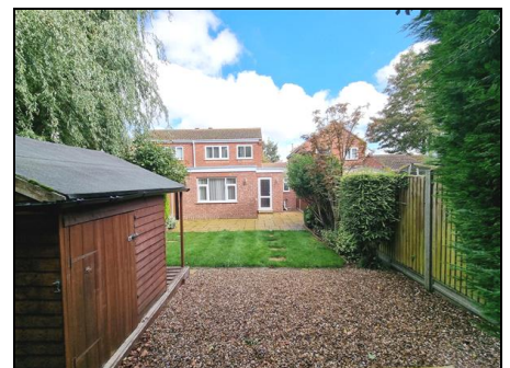
Further Garden Aspect