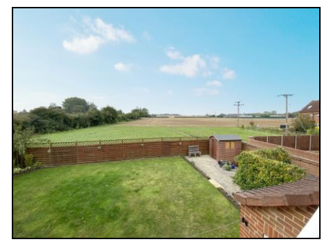
View To Front