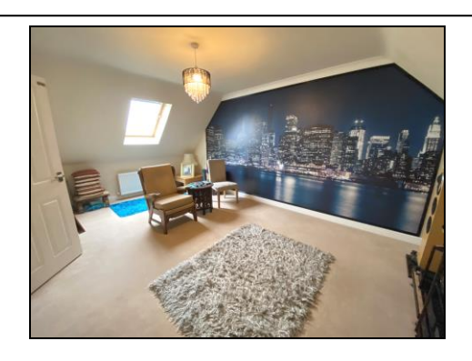
Bedroom 4 4.39m (14'5") x 3.53m (11'7")

Having Velux roof light, radiator and access to further void storage and airing cupboard