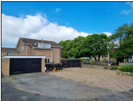
Further Front Aspect