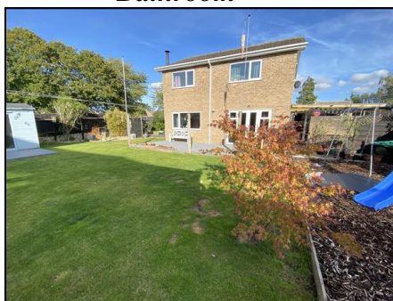
Further Garden Aspect