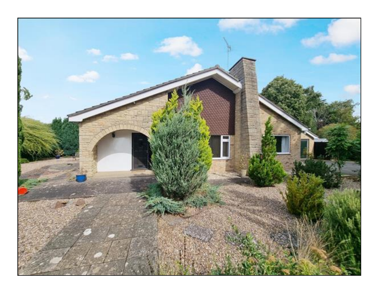
New Price £330,000

An individually designed and much larger than average Three Bedroom Detached Bungalow, situated on this generous corner plot and offered to the market with No Forward Chain. The property is located in a highly desirable residential area within walking distance of the town centre and benefits from Gas Central Heating and Double Glazing. The full accommodation comprises Entrance Hall, Cloakroom, Lounge, Dining Room, Kitchen, Utility Room, Three Double Bedrooms and Shower Room. Outside a larger than average driveway provides Ample Parking which leads to the Car Port and the Large Detached Garage with Workshop. The property has wrap around gardens which provide a high degree of privacy, and to fully appreciate the spacious accommodation available together with its superb setting, viewing is strongly recommended.