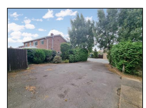
Front Garden Garage Drive Driveway