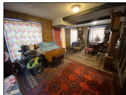
Former Shop Area

The property has a concrete area adjacent to the house which in turn approaches the Attached Store 14'5 x 6'9 . Adjacent to this is a Further Detached Store . The main garden is laid mostly to lawn with borders.