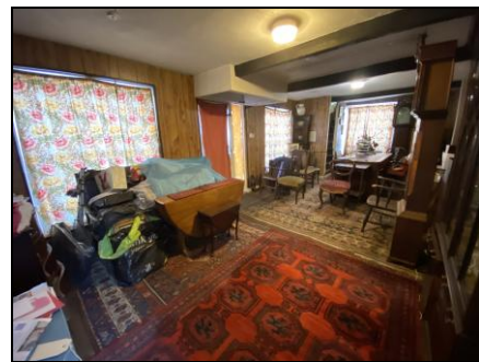
Former Shop Area

The property has a concrete area adjacent to the house which in turn approaches the Attached Store 14'5 x 6'9 . Adjacent to this is a Further Detached Store . The main garden is laid mostly to lawn with borders.