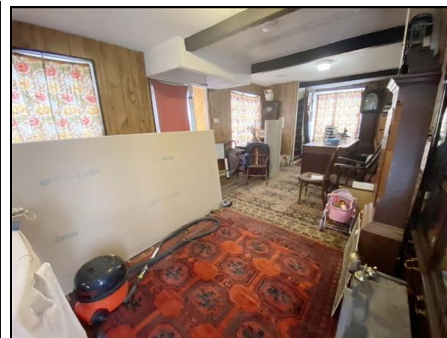
Former Shop Area

The property has a concrete area adjacent to the house which in turn approaches the Attached Store 14'5 x 6'9 . Adjacent to this is a Further Detached Store . The main garden is laid mostly to lawn with borders.