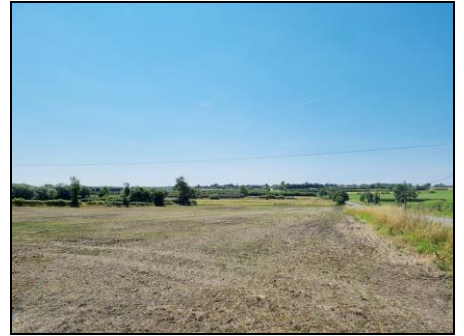
Further Garden photo and Views

GROUND FLOOR 1147 sq.ft. (106.5 sq.m.) approx.