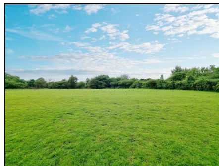
View To Rear