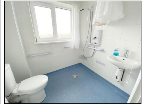
Wet Room Shower Room