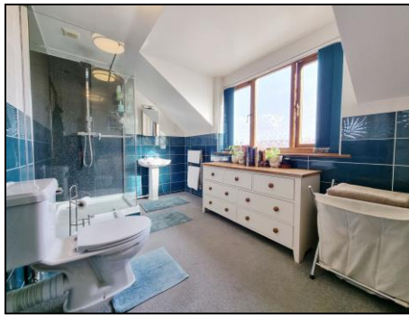
En-Suite to Bedroom 1