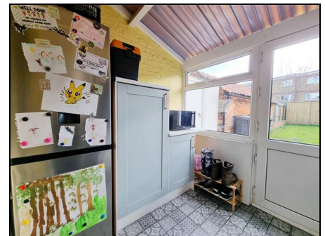
Utility Area/Sun Room