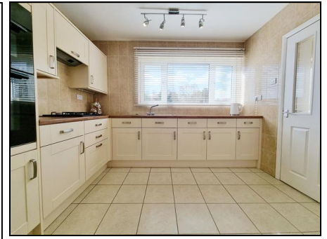
Further Kitchen Aspect

TOTAL FLOOR AREA: 1511 sq.ft. (140.4 sq.m.) approx. Whilst every attempt has been made to ensure the accuracy of the floorplan contained here, measurements of doors, windows, rooms and any other items are approximate and no responsibility is taken for any error, omission or mis-statement. This plan is for illustrative purposes only and should be used as such by any prospective purchaser. The services, systems and appliances shown have not been tested and no guarantee as to their operability or efficiency can be given. Made with Metropix ©2024