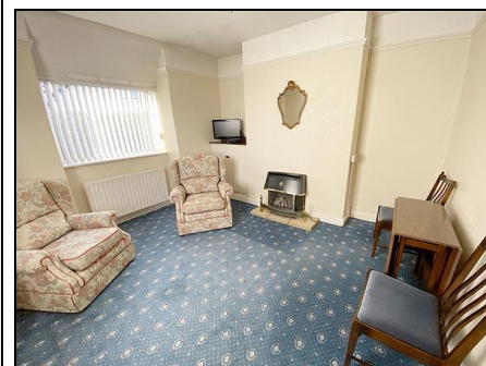
Dining Room/Bedroom 3