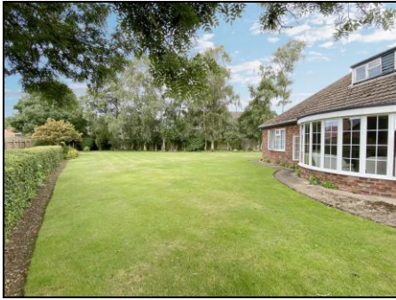
Further Garden Aspect