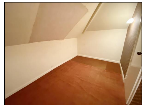
Attic Store Room 2