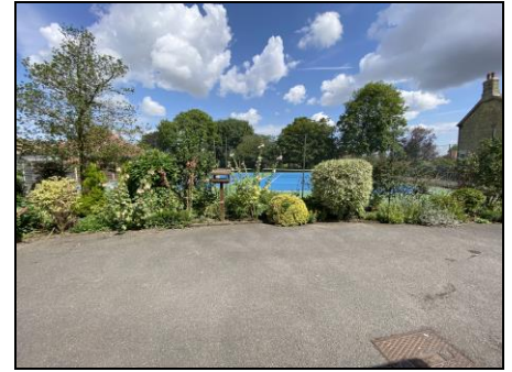
View To Front

GROUND FLOOR 1395 sq.ft. (129.6 sq.m.) approx.