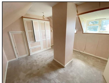
Attic Store Room 1