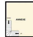
1ST FLOOR 303 sq.ft. (28.1 sq.m.) approx.