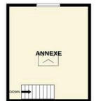
2ND FLOOR 303 sq.ft. (28.1 sq.m.) approx.