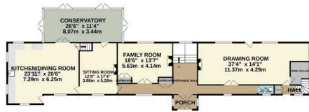
GROUND FLOOR 2107 sq.ft. (195.7 sq.m.) approx.