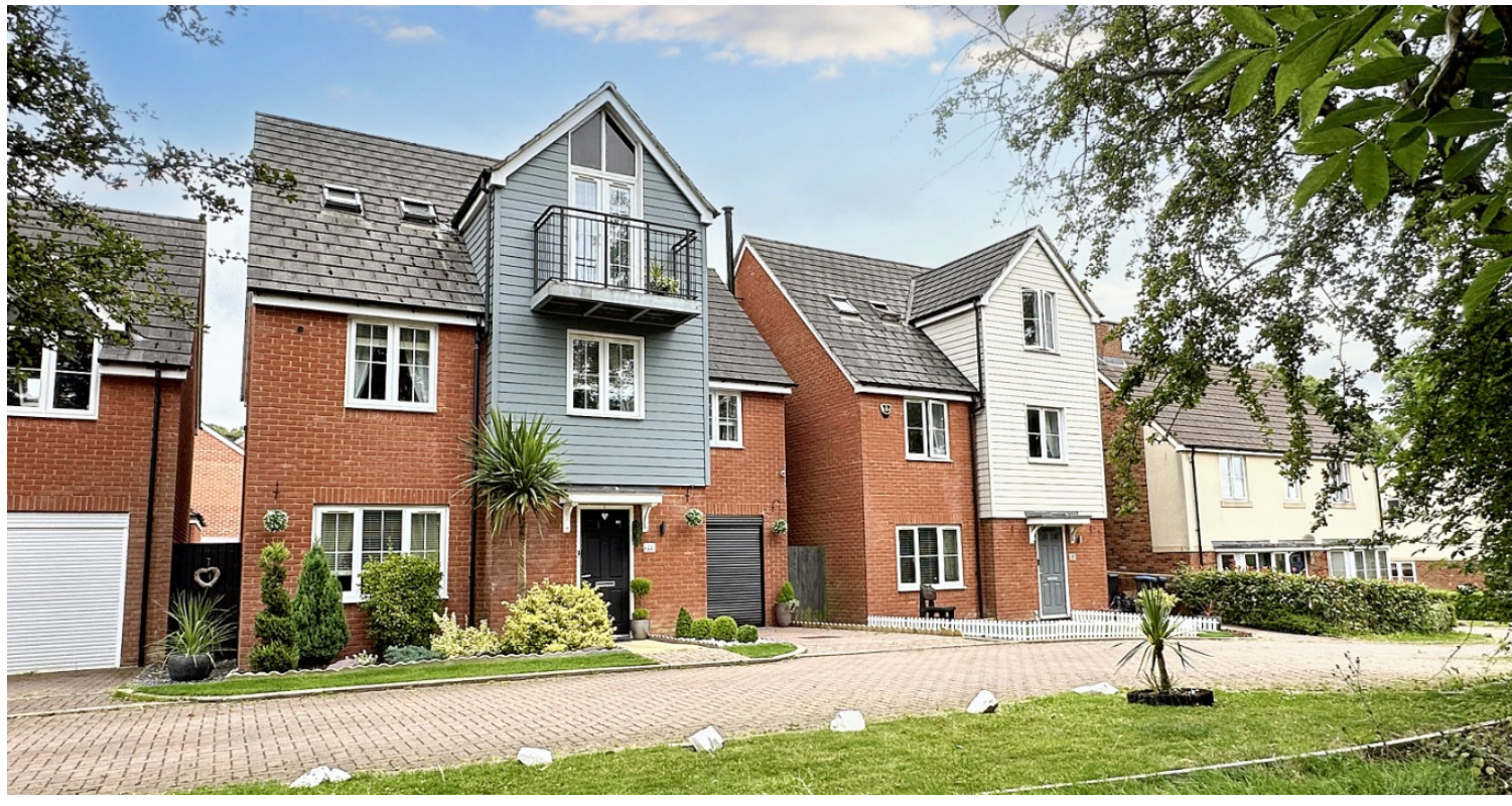
5 Bedrooms | 4 Bathrooms | 2 Reception Rooms | Garage