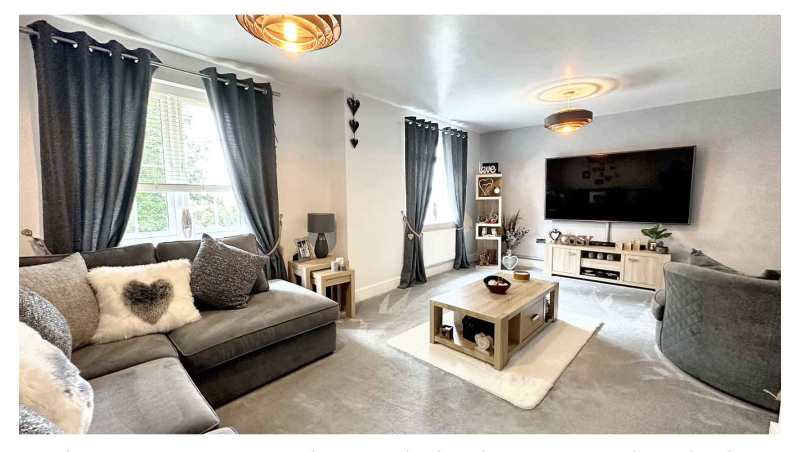
Five Bedroom Detached Property For Sale in Rugby, Warwickshire. Built by Cala Homes to the Linton Design, this stunning Five-Bedroom Home has had one, very careful owner from new.