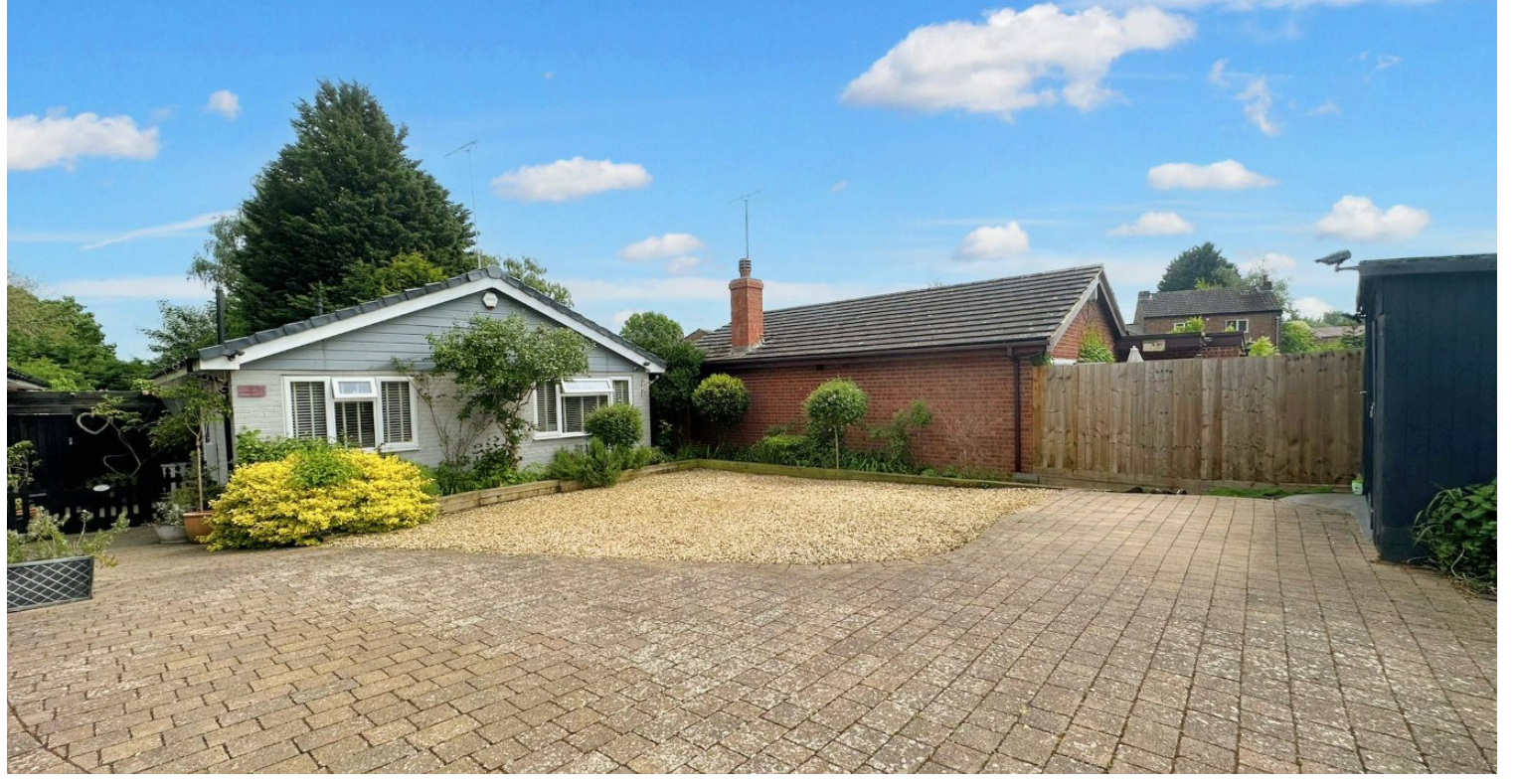
2 Bedrooms | 1 Bathroom | 2 Reception Room | Garage